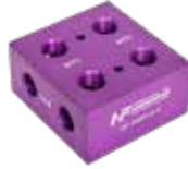
Purple Anodized Aluminum "Split" Manifold