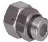
Metric "L" Swivel x BSPP (G) Straight Adapter