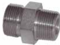
Male Metric "L" x Male NPT