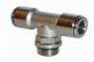
Metric Tube to Male SW BSPP (G) Branch Tee