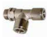
Metric Tube to Male BSPP (G) Run Tee