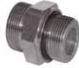
Male Metric "L" x Male BSPP (G)