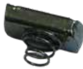
Spring Nut (Short Spring)