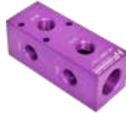
Purple Anodized Aluminum "Manifold"