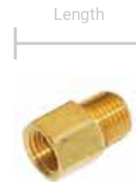
Brass Extension Adapter