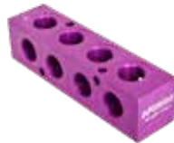
Purple Anodized Aluminum "T" Junction Blocks