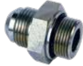
MJIC - MBSPP Conversion Adapter